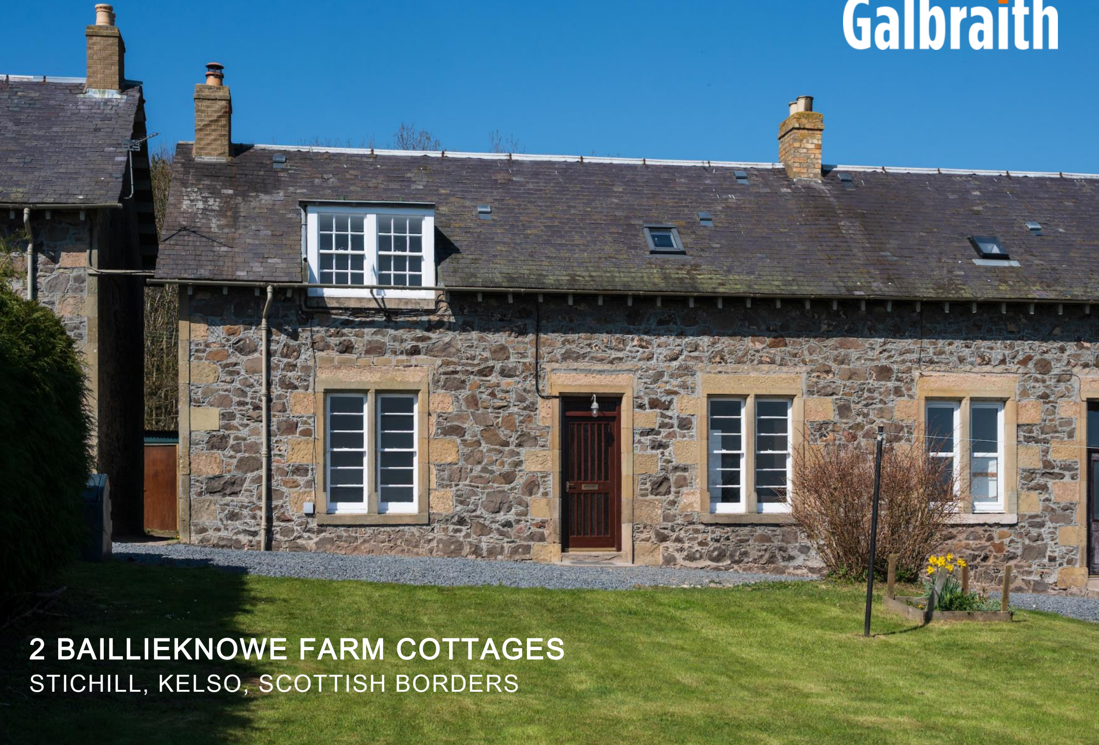
2 BAILLIEKNOWE FARM COTTAGES STICHILL, KELSO, SCOTTISH BORDERS